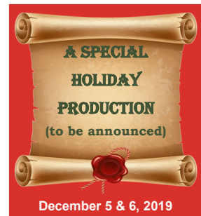
December 5 & 6, 2019

GREAT SEATS — Get first selection of seats.